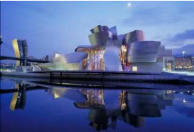
Figure 1 Modernity Features in guggenheim museum bilbao

The central claim of Berman's argument, that to be modern is to be confronted with disruption and change as everything(Berman, 1994, Whyte, 2004, Simon, 2005). On the other hand, Berman's notion of modernity as a period of continual transformation, arguing that the "concept of modernity expresses the belief that the future has already begun: it is the epoch that lives for the future, that opens itself up to the novelty of the future"(Berman, 1994).