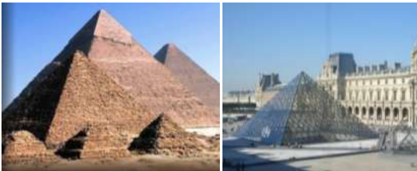
Figure 4 The Process of Transformation in Architecture