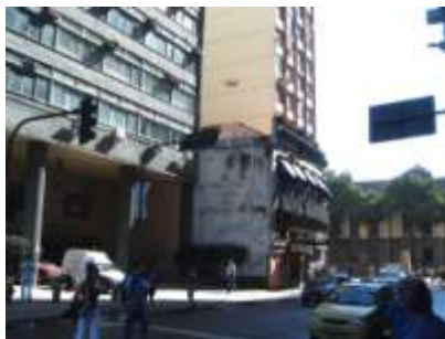
Figure 1: The Passos Ave.: Old town house has endured the new alignment of blocks with pilotis.

In the first situation, a paradox can be depicted: some buildings have been preserved by the PA, like in figure 1. As according to the new alignment, construction has become unfeasible in small lots, the PA avoids demolition of certain old town houses. Even though anachronistic, many of these P.A.s had been in force until preservation legislation had revoked them.