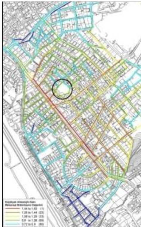
Figure 4 Küçükalyalı Archaeological Site Spatial Integration Analysis (Existing Situation)

As a result of the environmental criteria observation, it is evaluated that Küçükalyalı archaeological site is near to urban center and can be reached easily via public transportation. Because of the fact that the residential and commercial uses, which together shape the mixed land use feature of the site, makes the place vivid all day. There is no distinction between active and passive green spaces nearer to the site, whereas, the area comes out with its urban open space property that is used by public via children playground and mosque functions. Despite the importance of schools in interrelating the archaeological remains and education, there is no educational unit near to the area. According to spatial integration analysis it's observed that integration level is highest on the main street called "Eski Bağdat" street and then on the Atatürk street, whereas the integration of the archaeological site and the roads surrounding the site are low. This makes the Küçükalyalı archaeological site a segregated place within the urban environment (Figure 4).