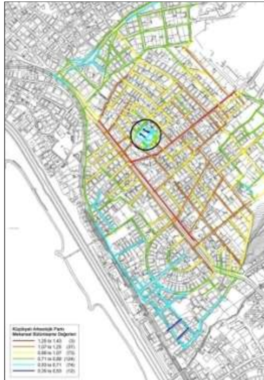
Figure 5 Küçükyalı Archaeological Park Spatial Integration Analysis (Proposed Situation)

As a result of the environmental criteria observation, by the proposed plan the archaeological site continues its characteristics by being a vivid place within an accessible urban area. The proposed plan makes up distinction between active and passive green spaces nearer to the site and puts forward its urban open space property that have integrated to children playground and mosque functions. Despite the importance of schools in interrelating the archaeological remains and education, there is still no educational unit near to the site. According to spatial integration analysis it's observed that integration level is highest on the main street called "Eski Bağdat" street but now moves to Karayollari Street, which is the main road to reach the park, and the integration of the roads surrounding the site has thus been increased. Although with the proposed park plan the remains got accessibility, the integration of area decreases because of the design proposal's fragmented road structure. Yet, the integration value of the proposed park decreases when compared to the existing situation (Figure 5).