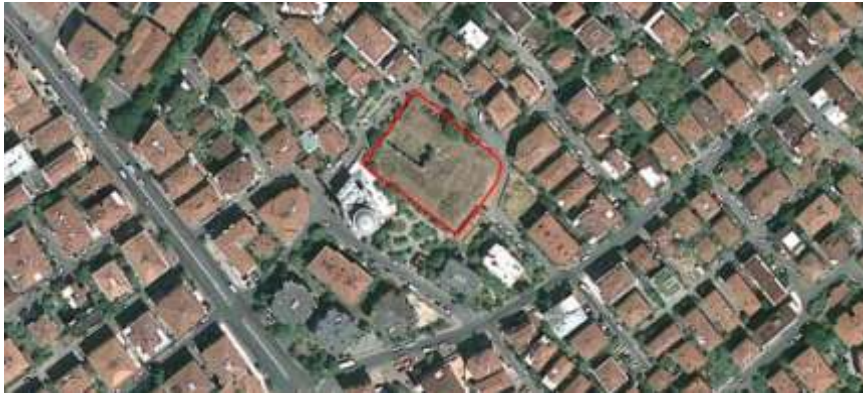
Figure 2 Küçükalyalı Archaeological Site

Küçükalyalı archaeological site is located in Anatolian side of Istanbul, with in the Maltepe district, Küçükalyalı vicinity, Çınar quarter. As most of the remains dating back to Byzantine period are located on European side of Istanbul, this archaeological area propounds importance for Anatolian part. Stated in TAY Project website (database of Archaeological Settlements of Turkey), J. von Hammer discussed these remains in 1822 and called the place as Satyros monastery dating back to 9 th century. On the other hand S. Eyice called these remains as Bryas Palace and supported his idea by stating that the remains of a wide structure having no apses cannot be a monastery. In 2000 Alessandra Ricci worked on these remains and called the place as Satyros Monastery. In 2008 excavations headed by Archaeology Museums and supervised by Alessandra Ricci got started (TAY Project). Today the area can be seen with its rectangular formed soil mass (Figure 2). Inside the archaeological area, remains belong to a huge cistern are seen. This archaeological area is an urban open space used by inhabitants. It is surrounded by Çınar Mosque, children playground and the surrounding residential building pattern. In order to make this area a place for urban development, archaeological park works are being carried out.