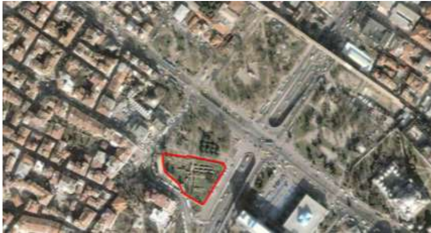
Figure 3 Saraçhane Archaeological Site

fenced. Therefore, today the archaeological site is not accessible and it is disordered.