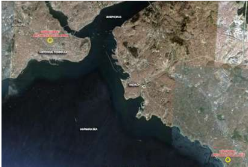
Figure 1 Location of the study area

literature surveys on archaeological parks. In this study in order to determine the criteria of archaeological parks and to evaluate the integration of these areas to urban layout; Küçükyalı and Saraçhane, which show differences in their environmental conditions, usage cases and the user profiles, archaeological areas are selected (Figure 1).