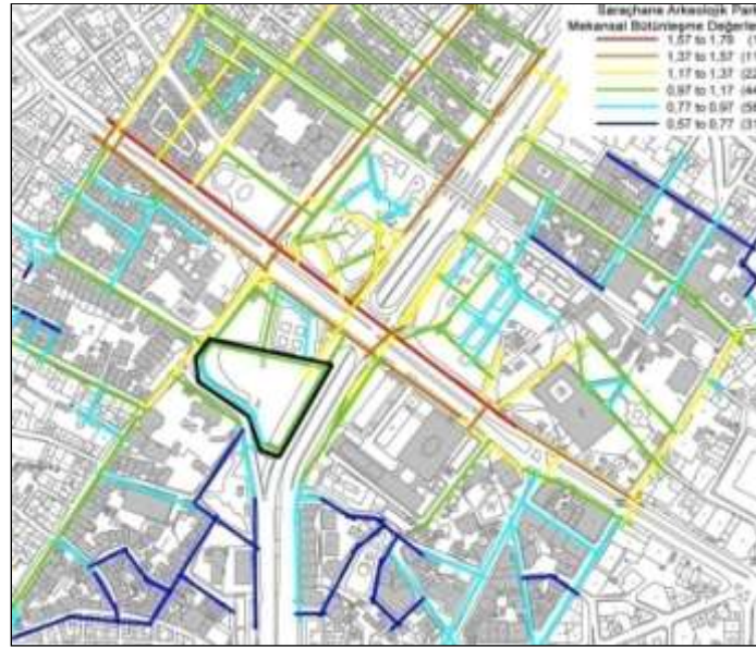
Figure 6 Saraçhane Archaeological Park Spatial Integration Analysis

For the development of the park, works on field are required but according to the technological criteria analysis there are no excavation- research studies in the area. The lack of improvement operations results in the lack of presenting the remains to public. As there are no publications, such as website or brochures, the potential of area in reaching the public is limited.