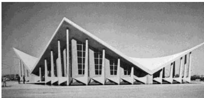
Figure 6. Exhibitions and convention hall. ProNaF's Commercial Center in construction in the 1960s. Anonymous author.