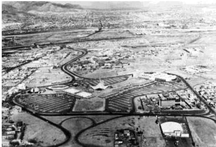
Figure 5. Aerial imagen of ProNaF’s Commercial Center in construction in the 1960s. Anonymous author.

Nevertheless, as in UNAM’s University City (Mexico 1946-1953), the important elements of the project are not only “the parts”, but also “the group impression”, the group is a collective fact. In the project’s extreme west, the cultural zone settles down with subtle reminiscences of the region’s pre-Hispanic architecture, like the ones used in the Pedro Ramirez Vazquez’s Art and History Museum building (Figure 6), or in the Enrique de Moral’s Crafts Market building. In the east part of the project, the Camino Real hotel was inspired by the convent and haciendas (farms) architecture, first of many Ricardo Legorreta’s hotels. To the center is represented the most modern Mexico, with an exhibitions and convention hall that retakes Felix Candela’s parabolic building forms. All the strolls generated between these buldings are accompanied by a linear commerce development and green spaces, designed by the Mario Pani’s architecture office. Within this commercial infrastructure, the first and greater border supermarket was constructed. The new urban form defined by the superblock established the deeper morphological transformation processed in Ciudad Juarez during the 20 th century (Figure 7).