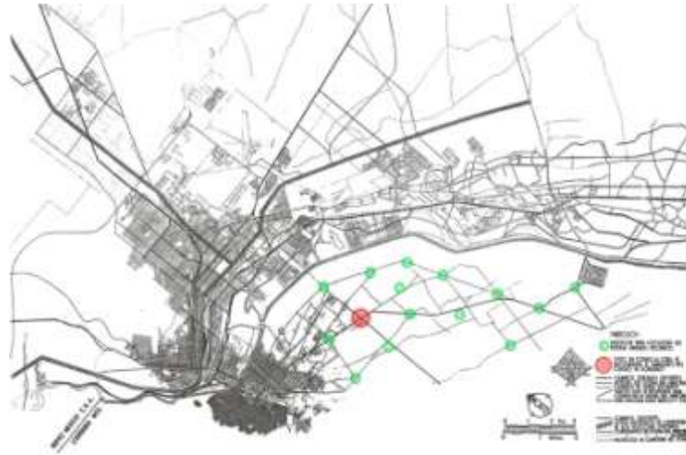
Figure 1. Draft Regulatory Plan, 1958. In green the future neighborhood units, in red a government center. Municipio de Ciudad Juárez. (1958) (colors added by the authors).

of the Ciudad Juárez's compact and monocentric fabric with the extended urban development of El Paso city (occurred throughout the border). The 1958 Ciudad Juárez Draft Regulatory Plan, proposed the city extension over the Juárez Valley' agricultural fields, using neighborhood units distanced 1.5 to 2 km between each other, leaving agricultural areas among them (Figure 1).