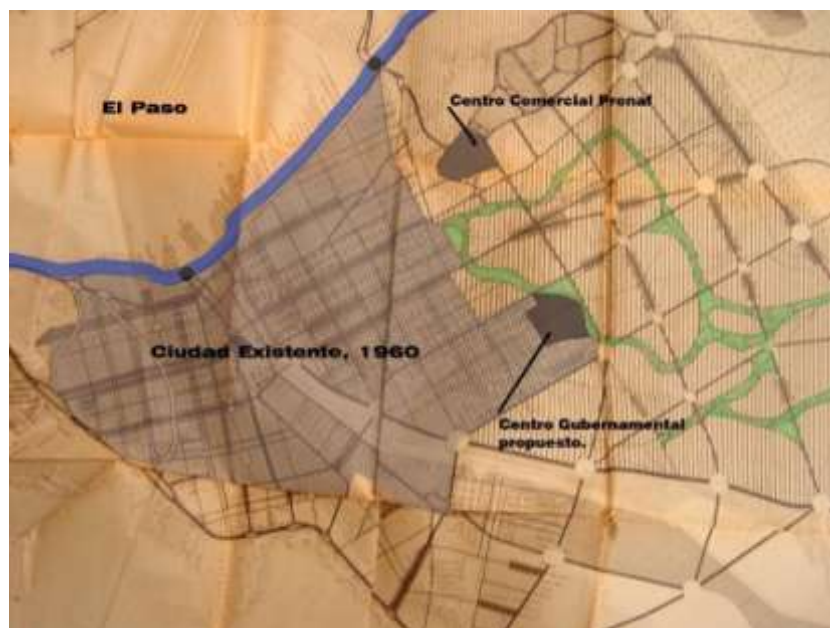
Figure 4. Ciudad Juarez - El Paso Integration Plan, 1962. In green the urban cells associated to the 1958's neighborhood units surrounded by parways along the Acequias. In dark gray the governmental center and ProNaF Commercial Center. COMDUF, 1962.

The idea of “urban cells” proposed the possibility of reproduction and transformation of the urban fabric from neighborhoods in a biological analogy that underlies the definition of two characteristic areas: a peripheral zone and a core or inner zone. These aggregation units will allow a greater functional autonomy for the development of community life, and in this sense, expresses a relation with the proposal from earlier decades of the neighborhood units. The neighborhood becomes the unity of urban transformation that allow the construction and transformation of the modern city. In this sense, the proposal moves away from the functional conception of the Athen’s Chart and can be placed on the theoretical line of post-war CIAM, characterized by the criticism of the rigidity and abstraction of the functional city and the crossing of CIAM’s and Anglo-Saxon urban theories to the possibilities of the modern city.