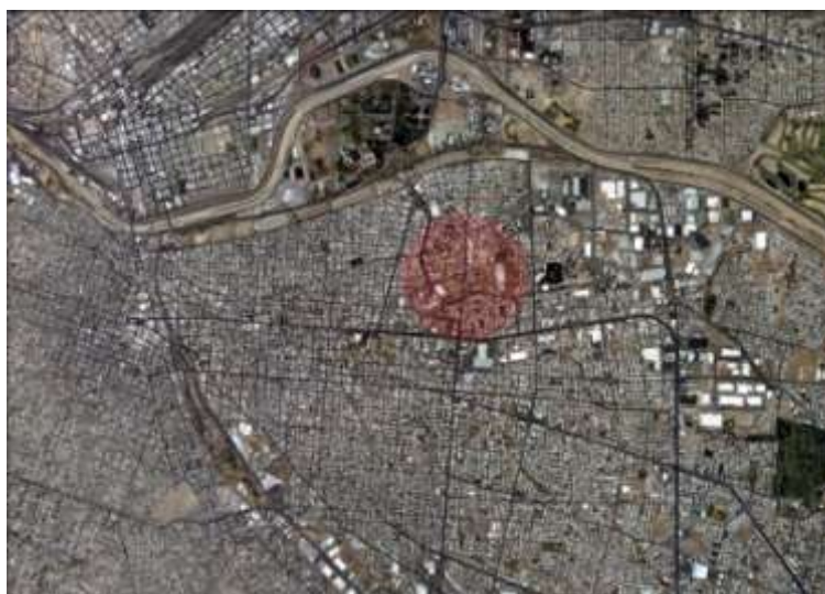
Figure 7. Aerial imagen of Ciudad Juarez, 2007. In red the ProNaF superblocks, showing the morphological change compared to the traditional urban fabric. Note the road direct connection with El Paso city. Scheme made by author from Google Earth's Digital Image.