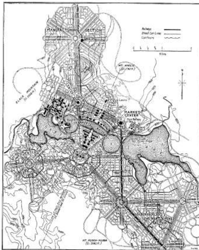
Figure 2: The Griffin plan for Canberra, 1912 (from Engineering News (USA), July 1912) A redrawn version of one of the competition winning plans by the Chicago-based Walter Burley and Marion Mahony Griffin. This combined city beautiful, garden city and diverse other influences into a distinctive landscape-driven plan.

By the mid-1950s Canberra was a ‘garden city in the doldrums’ (Stephenson, 1990, 48). It was caught between ad hoc responses to post-war growth pressures, the somewhat ill-fitting geometric legacy bequeathed in 1912, and a small garden town mentality. A single planner, Trevor Gibson, buried away in the Commonwealth Department of the Interior was doing his best to balance the legacy of the past, contemporary best planning practice, and what consensus could be secured on the city’s future. What was shaping as a potential national embarrassment was to be averted by a major parliamentary inquiry by a Senate Select Committee which would bequeath a radical new governance structure. The National Capital Development Commission (NCDC) was formed as an all-powerful body to design, develop and construct the city under an act of parliament approved in August 1957. It was a new town styled corporation inspired partly by British models and the special-purpose Snowy Mountains Hydro-Electric Authority, another contemporary Australian project of national significance. The NCDC’s vertically integrated holistic organisation was conceived to single-mindedly prosecute the specific objective of city development. By the late 1960s the NCDC had transformed the isolated ‘bush capital’ into a city which many contemporary observers regarded as the model planned metropolis of the late twentieth century.