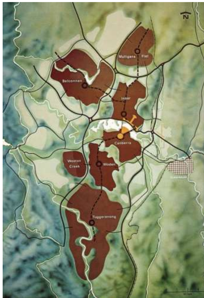
Figure 3: The 'Y Plan' from Tomorrow's Canberra (NCDC, 1970)